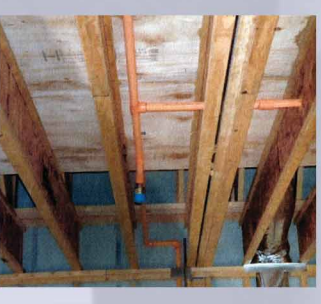
Each sprinkler protects an area below, and when heated by fire, activates.

Only the sprinkler closest to the fire will activate, spraying water directly on the fire.